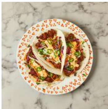
Fiery Chipotle Meat-Free Tacos with Coriander Slaw (10 mins)