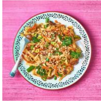
Plant-Based Mushroom Pad See Ew-Style Noodles Curry (25 mins)