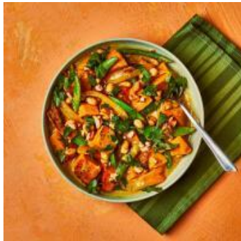
Nutty Sweet Potato & Sugar Snap Curry (30 mins)