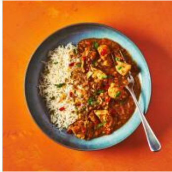
South Indian-Style Chicken Cashew Curry (30 mins)

You can see Gousto's menu on their website here . Below are examples of meals you will find on their website. Over the first 6 weeks, on average these would each cost £1.79 per portion including delivery if you ordered 4 recipes with 4 portions.