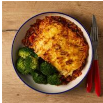
Comforting Cottage Pie (40 mins)